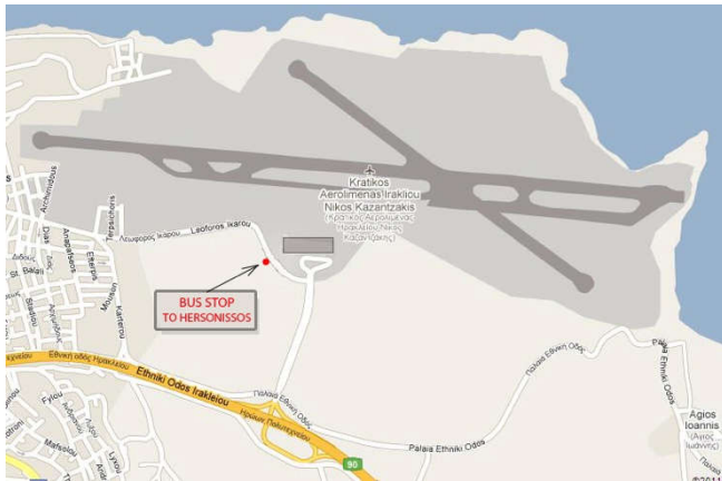
Figure 2: Heraklion Airport and Bus Stop to Hersonissos