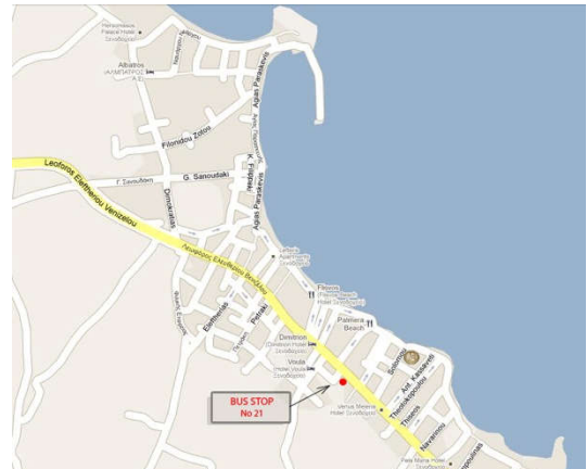
Figure 3: Map of Hersonissos