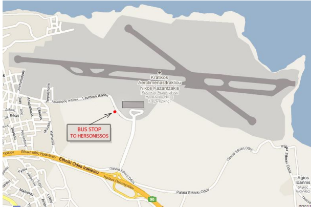
Figure 2: Heraklion Airport and Bus Stop to Hersonissos