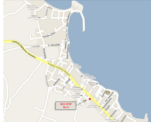
Figure 3: Map of Hersonissos